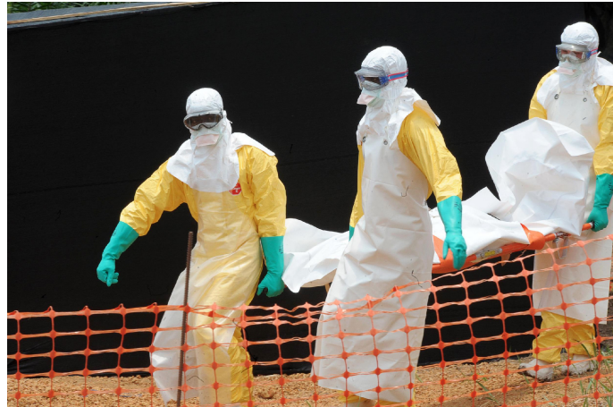
Ebola workers in Zaire.

publicly about how our superior health care system would make fighting Ebola different in the U.S. stands in stark contrast to what actually occurred when the first patient arrived, and the situation was no better than that in Liberia.