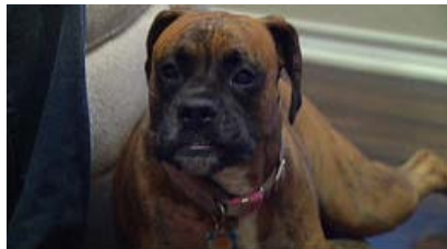
Dog Weed-Whacked at Dallas Dog Park