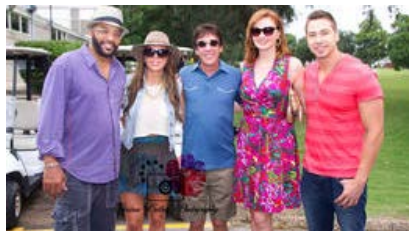
Cast to Continue Kidd Kraddick in the Morning