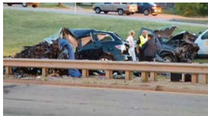
Wrong-Way Crash Kills Four In South Dallas