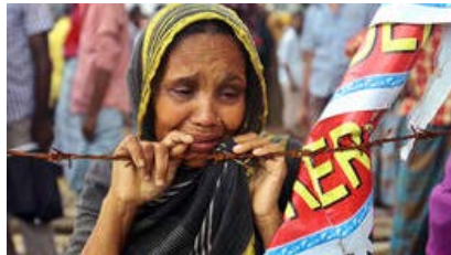
Top News Photos of the Week