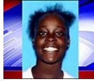
Crimestoppers: Authorities on the hunt for woman wanted for