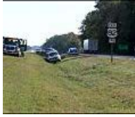
Pedestrian fighting for life after being hit in Montgomery