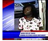
Crimestoppers: Montgomery Police looking for thieves who've been