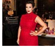
Kim Kardashian's Maternity Style: Love It or Hate It? Parent Media