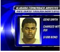
Crimson Tide football player arrested