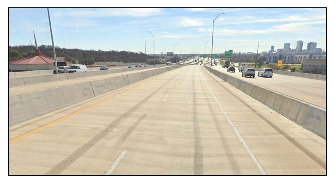
Figure 1. Approximate location of crash, looking south.

On Thursday, February 11, 2021, about 6:00 a.m. central standard time, a multivehicle crash occurred in the southbound toll lanes of Interstate 35 West (I-35W), in Fort Worth, Tarrant County, Texas. The crash happened near the exit to Northside Drive and involved about 130 vehicles. The southbound traffic lanes consisted of two toll lanes and three general-use lanes. The posted speed limit was 75 mph for the toll lanes and 65 mph for the general-use lanes. The southbound toll lanes were separated from the northbound toll lanes by a 42-inch-high sloped concrete barrier and from the southbound general-use lanes by a 36-inch-high back-to-back concrete rail barrier (figure 1).