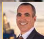
LEONARD B. GABBAY, P.C. WARRIORS FOR THE INJURED