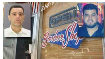
Fired Employee Shot and Killed Former Boss: DPD

Killed were Abigail "Abbey" Key, 15, and