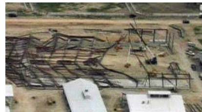
4 Injured in Texas A&M Construction Accident