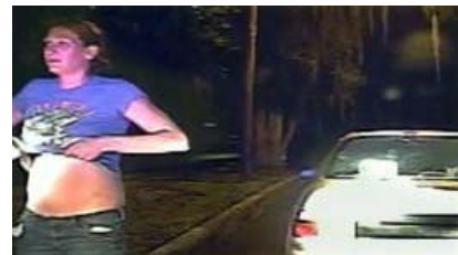
Humiliating Police Search Caught on Cam