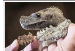
6-foot-long lizard shared planet with mammals