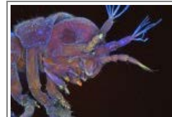
Ask ‘gribbles’ how to turn wood into liquid fuel