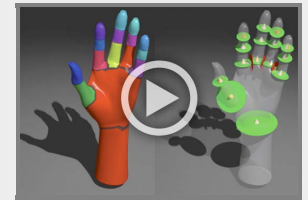
Software adds joints for 3D printed figures