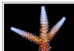
How corals build their skeletons