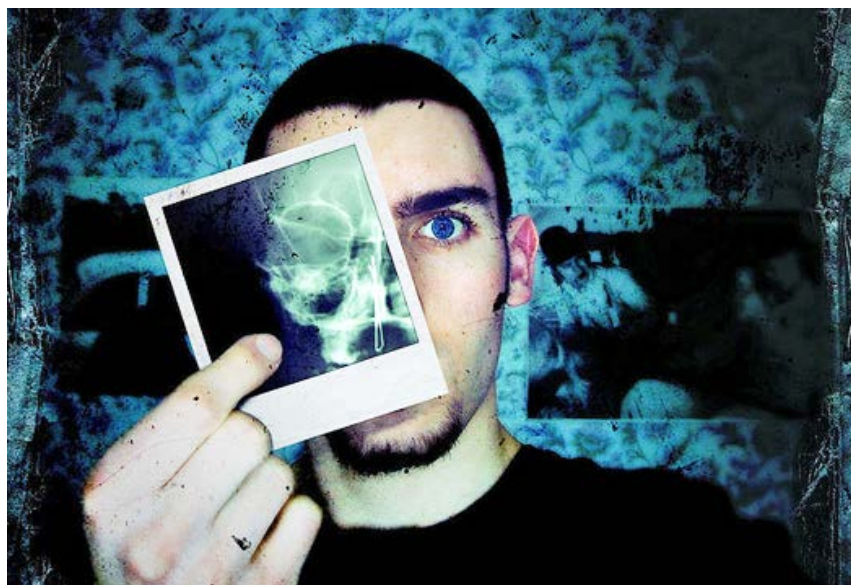
Based on other studies, it appears there is a six-hour window before the memory is reconsolidated after recall and cannot be altered. Likewise, there is no effect if the information is presented in a different context than the original memory.

IOWA STATE (US) — It may be possible to alter memory simply by suggesting different information, but timing and context are key.