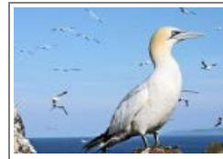
Sea birds ‘do math’ to divvy up turf

That’s why good college students go home and immediately go over their notes from each class – to rewrite or type up the notes also helps clarify any ambiguous symbols used.